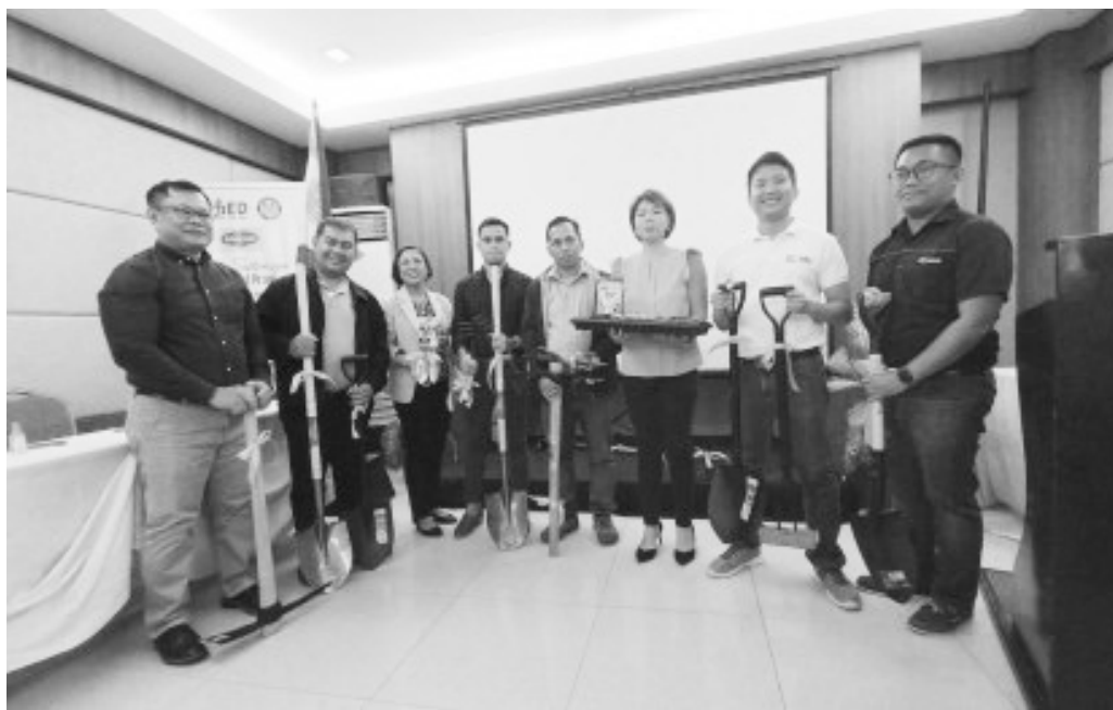
USING THEIR PRODUCE. Farm schools in Western Visayas receive farm implements from the Maggi, a food and flavoring brand of Nestle Philippines, following the signing of the memorandum of agreement for the Sarap Sustansya Farm School program held in Iloilo City on Tuesday (July 18, 2023). The program aims to equip learners with skills in preparing affordable and nutritious meals from out of their produce.

It aimed to contextualize career agricultural options for learners and provide them with certifiable technical skills to be productive leaders in agricultural innovations, and produce champions who are globally competitive and equipped with