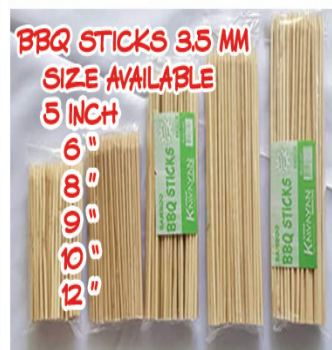
BBQ STICKS 3.5 MM SIZE AVAILABLE 5 INCH 6 INCH 8 INCH 10 INCH 12 INCH