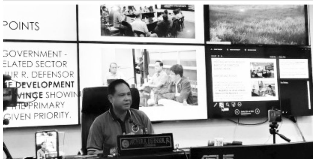
INCREASED PRODUCTION. Iloilo Governor Arthur Defensor Jr. says the province targets to increase its rice production to 5.5 metric tons per hectare from 3.5 metric tons in a press conference at the provincial capitol on Wednesday (Aug. 9, 2023). He said the province is looking at the national government's rice hybrid program to maximize production, to be able to export outside of Iloilo, and have a secured buffer.