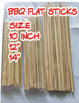
BBQ FLAT STICKS SIZE 10 INCH 12 INCH 14 INCH