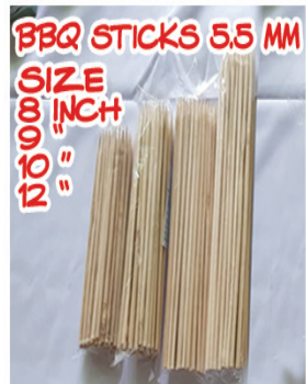
BBQ STICKS 5.5 MM SIZE 8 INCH 10 INCH 12 INCH