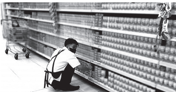
NO SIGNIFICANT ADJUSTMENTS. A worker arranges canned goods on the shelves in a grocery store in Quezon City in this undated photo. The Philippine Amalgamated Supermarkets Association on Tuesday (Dec. 5, 2023) said suppliers of basic commodities have not made significant adjustments to the prices of their goods.

PAGASA's nationwide membership is composed mostly of small- and medium-sized supermarkets. (PNA)