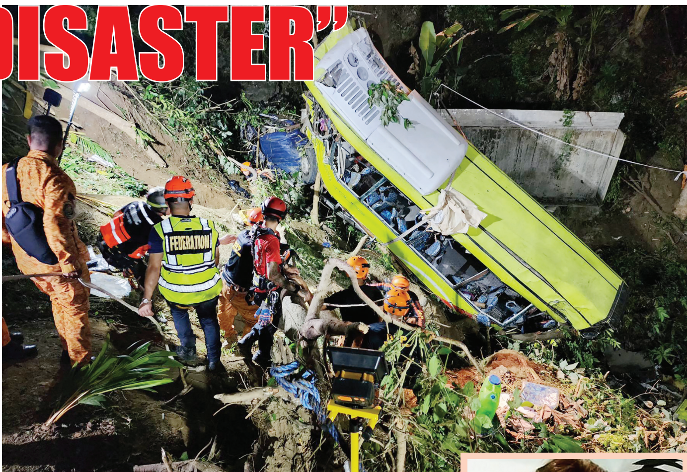
RESCUE OPERATION. Rescuers from Antique and Iloilo City rush to the site where Ceres bus with body number 6289 fell to rescue survivors and retrieve the bodies of the casualties. The rescue and retrieval operations lasted until the wee hours in the morning of December 6, 2023.