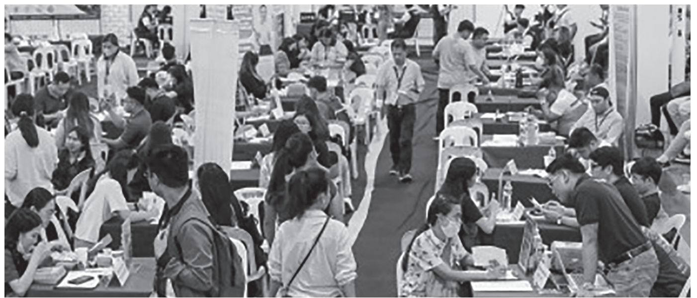
LOWER UNEMPLOYMENT RATE. Jobseekers attend a mega job fair at the Manila Science High School Manila's new building on Dec. 1, 2023. Philippine Statistics Authority data showed that the unemployment rate went down to 4.2 percent in October this year.

In a separate statement, the National Economic and Development Authority (NEDA) cited the importance of expanding opportunities for individuals to reskill or upskill while sustaining efforts to create an environment promoting high-quality jobs.