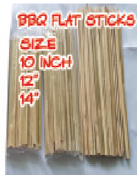
BBQ FLAT STICKS SIZE 10 INCH 12 INCH 14 INCH