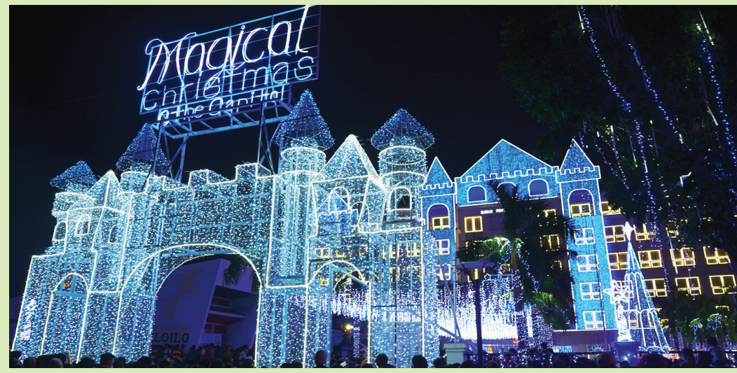
MAGICAL CHRISTMAS. The Iloilo Provincial Capitol building and compound is aglow with colorful lights this Christmas season. Throngs of people flock to the area nightly to enjoy the Disney-inspired Christmas lights and at the same time feel the spirit of holidays.