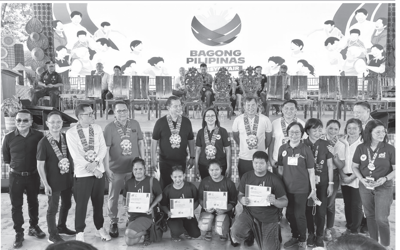
The event was graced by House Speaker Ferdinand Martin G. Romualdez, and House Representatives Janette Garin, Ferjenel Biron, Jam Baronda, Michael Gorriceta, Lorenz Defensor, Teodorico Haresco Jr., Francisco "Kiko" Benitez, Jojo Ang Ferj, Janette Garin, Antonio Legarda Jr., Raul "Boboy" Tupas, Jane T. Castro and Carlito S. Marquez, among others.

Costumes of participating festivals will also be showcased in the Kasadyahan Festival exhibit.