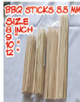
BBQ STICKS 5.5 MM SIZE 8 INCH 10 INCH 12 INCH