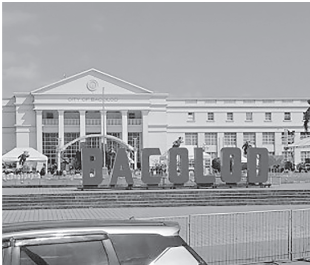
The Bacolod City Government Center

Republic of the Philippines Sixth Judicial Region REGIONAL TRIAL COURT Iloilo City OFFICE OF THE CLERK OF COURT & EX OFFICIO SHERIFF