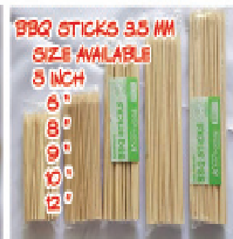
BBQ STICKS 3.5 MM SIZE AVAILABLE 8 INCH 6 INCH 10 INCH 12 INCH