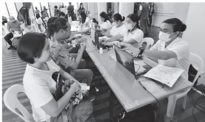
DRUG TEST. Employees of the Negros Occidental provincial government queue up to undergo mandatory drug testing at the Capitol Social Hall in Bacolod City on Tuesday (Dec. 12, 2023). Eight employees who tested positive for drug use and 20 others whose results were in the “gray” zone were subjected to confirmatory tests.

The confirmatory test results will be released within the week.