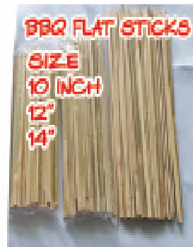
BBQ FLAT STICKS SIZE 10 INCH 12 INCH 14 INCH