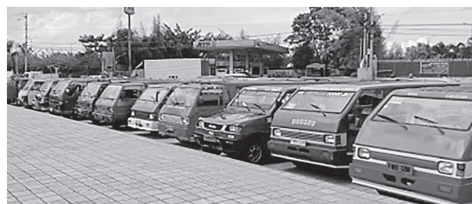
TRADITIONAL PUJs. Traditional jeepneys operating in Bacolod City in this undated photo. Data on Tuesday (Jan. 2, 2023) showed that only 23 percent or 540 of the 2,313 traditional jeepneys in the city have consolidated into either a cooperative or a corporation, which is the first step of the Public Utility Vehicle Modernization Program.

FOR YOUR ADVERTISING NEEDS Please contact TEL. NO. 320-1509 / 508-8725