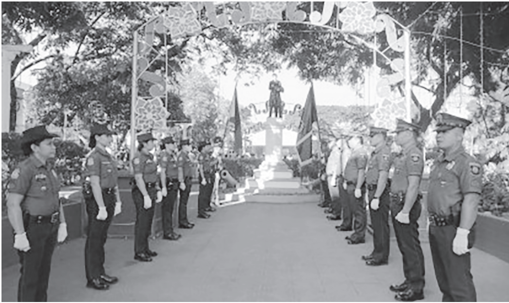
COMMEMORATION. The Antique Provincial Police Office personnel pay tribute to Dr. Jose Rizal on Saturday (Dec. 30, 2023) at the Evelio B. Javier Freedom Park in San Jose de Buenavista. Antiqueños were urged to delve into the ideals and principles laid out by Rizal, the visionary who dedicated his life to the betterment of the nation.