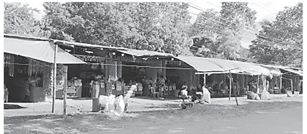
RED ALERT. Firecrackers are sold at the Dalipe Tradetown in San Jose de Buenavista town in Antique on Friday (Dec. 29, 2023). Antique Provincial Disaster Risk Reduction and Management Office (DRRMO) has issued a directive to its personnel and that of the municipal DRRMO to be on “red alert” to ensure a safe observance of New Year’s Day revelries.

Meanwhile, Antique Provincial Police Office