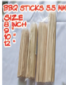
BBQ STICKS 5.5 MM SIZE 8 INCH 10 INCH 12 INCH 14 INCH