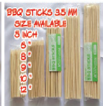
BBQ STICKS 3.5 MM SIZE AVAILABLE 8 INCH 6 INCH 10 INCH 12 INCH