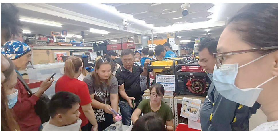
GENSETS LIKE HOTCAKE! Ilonggos trooped to hardware stores to buy generator sets following the massive and continuous power interruptions since January 2, 2024.

In 2018, Batangas Governor Hermilando Mandanas and then Bataan congressman Enrique Garcia challenged the computation of the just share of LGUs in the national taxes. (PNA)