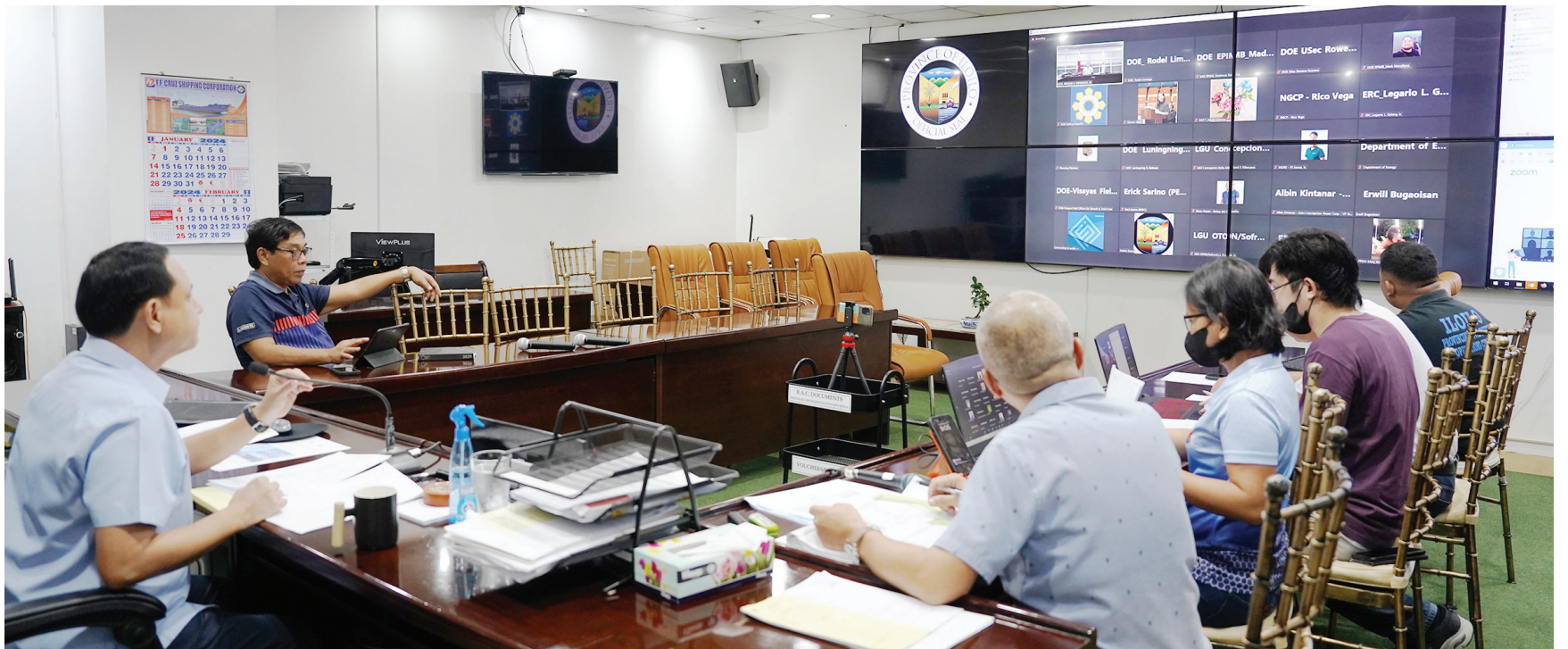
POWER MEETING. Governor Arthur Defensor, Jr. leads the conference with the officials of National Grid Corporation of the Philippines (NGCP), Department of Energy (DOE), and Energy Regulatory Commission (ERC) and other stakeholders via Zoom platform to tackle issues and concerns relative to the massive power outage on Panay Island and parts of Negros Occidental since January 2, 2024.