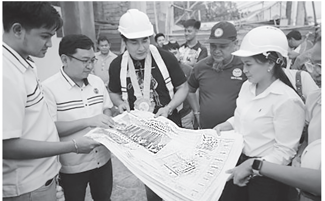
PROJECT. Senator Ramon Revilla Jr. (third from left) and Iloilo City Lone District Rep. Julienne Baronda (fifth from left) view the project plan of the two-story multipurpose building that will rise in Brgy. Tanza Esperanza during the site visit on Saturday (Jan. 27, 2024). Revilla committed PHP50 million for the boardwalk adjacent to the building.

ILOILO CITY – A multipurpose center that will serve as an evacuation center during calamities and economic enterprise for drug dependents will stand to benefit not only those in Barangay Tanza Esperanza but also the other neighboring villages in the City Proper.