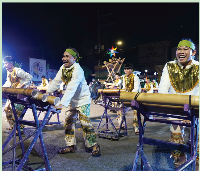
KASADYAHAN CHAMPION. Tribu Tultugan Festival of Maasin, Iloilo is the Champion in the Kasadyahan sa Kabanwahan of the 2024 Dinagyang Festival. They also won the special awards, namely, Best in Discipline, Best in Music, Best in Performance, and Best in Choreography.