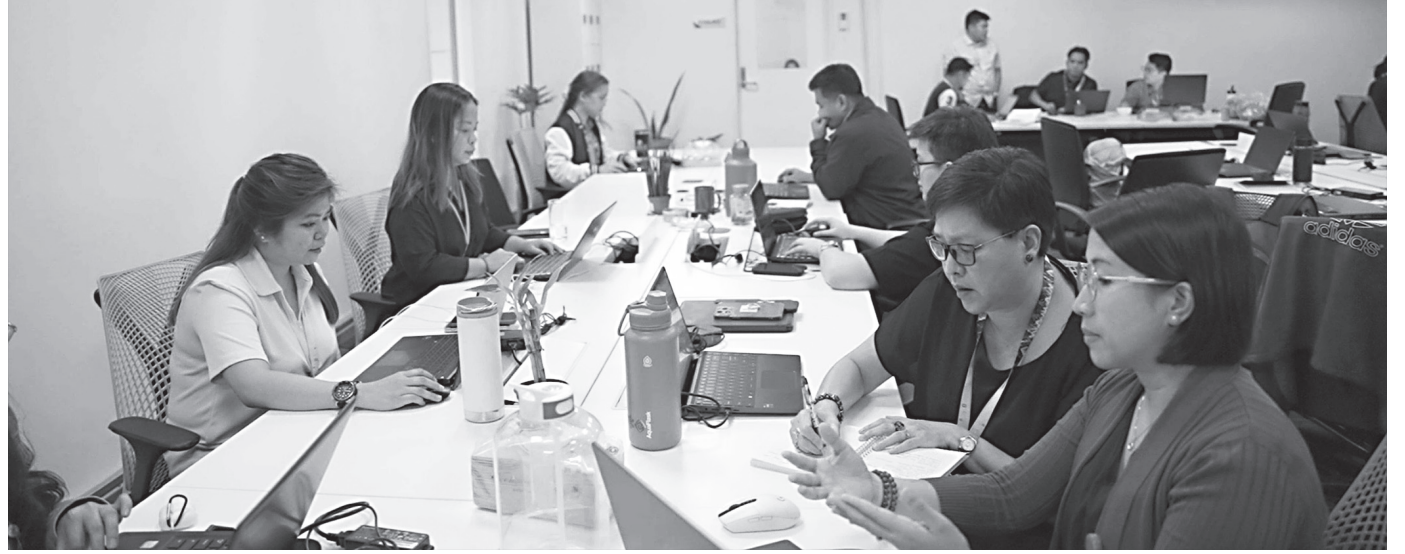
STT GDC has been recognized as a Great Place to Work® in the Philippines.

As the company undergoes aggressive capacity expansion, it focuses on sourcing and developing talent from the country's pool of