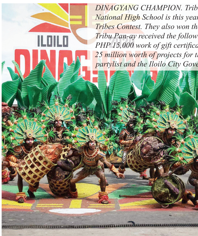
DINAGYANG CHAMPION. Tribu Pan-ay of Fort San Pedro National High School is this year's Champion in the Dinagyang Tribes Contest. They also won the special award in Best in Music. Tribu Pan-ay received the following prizes: PhP 1 million cash, PHP 15,000 worth of gift certificates from MangInasal, and PHP 25 million worth of projects for the school from Uswag Ilonggo partylist and the Iloilo City Government.