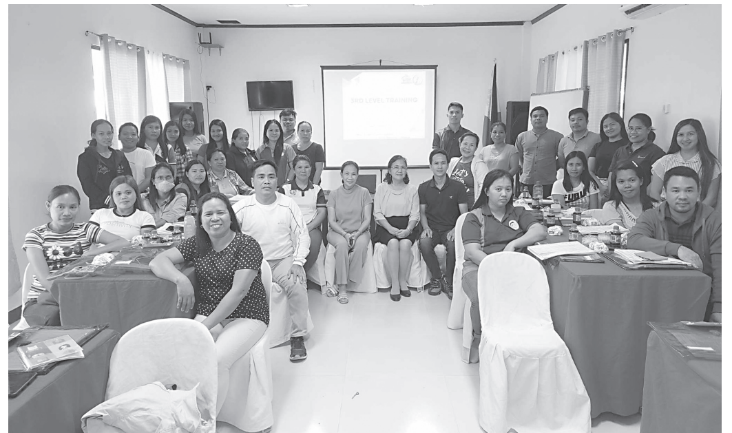
PSA-Guimaras conducts training for the 2024 L January round labor Force Survey (LFS) and 2023 Family Income and Expenditure Survey (FIES) V2 at NVMPCC Concordia Sur, Nueva Valencia, Guimaras