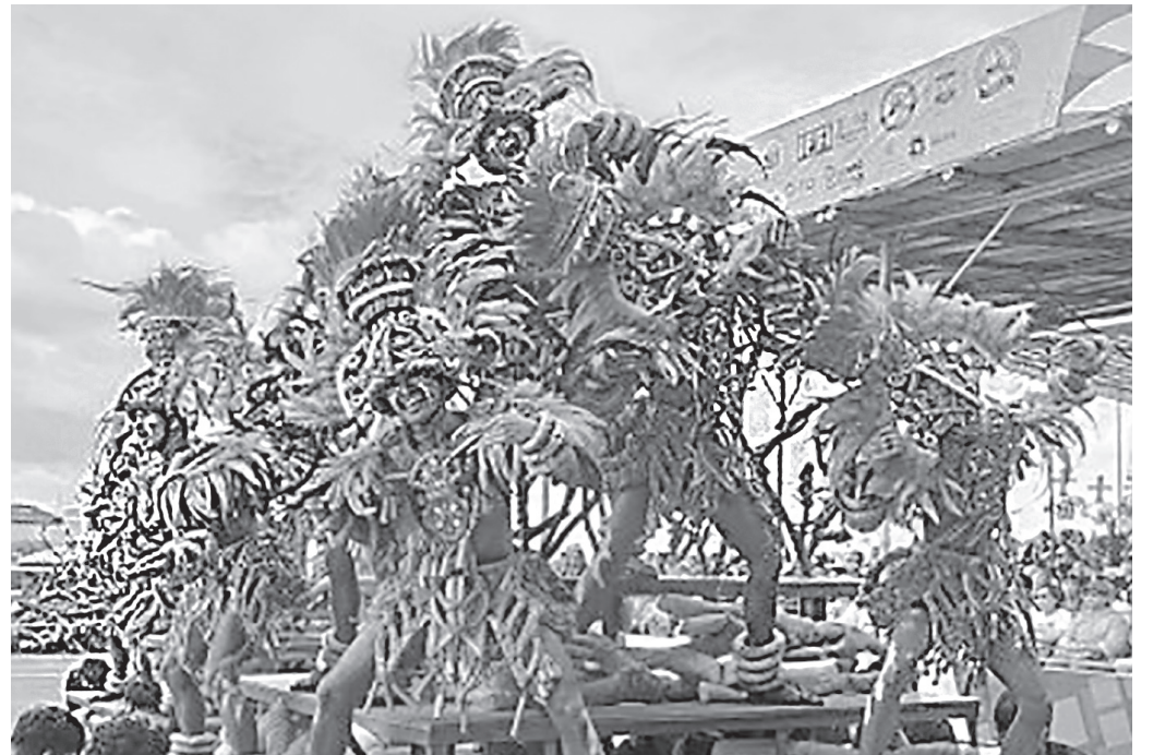
OPPORTUNITIES. A tribe performance during the 2024 Dinagyang Festival at the Freedom Grandstand in Iloilo City on Sunday (Jan. 28, 2024). The sustained celebration, according to its organizers, brings benefits not only for the city but also for the province of Iloilo.

The weeklong events of the festival, which is held every January in honor of the Señor Santo Niño, culminated over the weekend. (PNA)