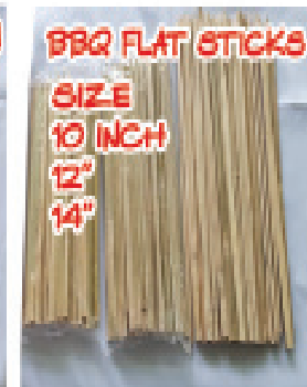
BBQ FLAT STICKS SIZE 10 INCH 12 INCH 14 INCH