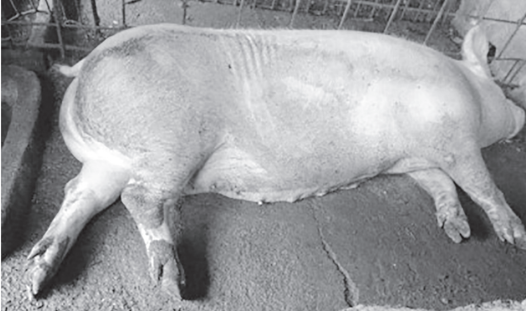
ASF-FREE GOAL. A dead pig San Jose de Buenavista, Antique on July 11, 2023. The town hopes to be declared African swine fever-free by February so hog raisers could resume their source of livelihood.