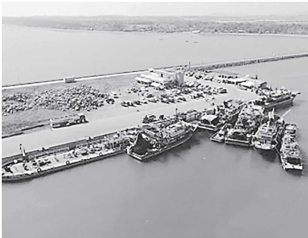
COMMERCIAL HUB. The commercial port of Cadiz City in Negros Occidental in this file photo. The northern Negros city is being eyed as a potential agriculture hub for Metro Manila using its port and the port of Batangas as conduit ports.

Escalante said Cadiz, which has 54,000 hectares of land, has vast potential as the city government also