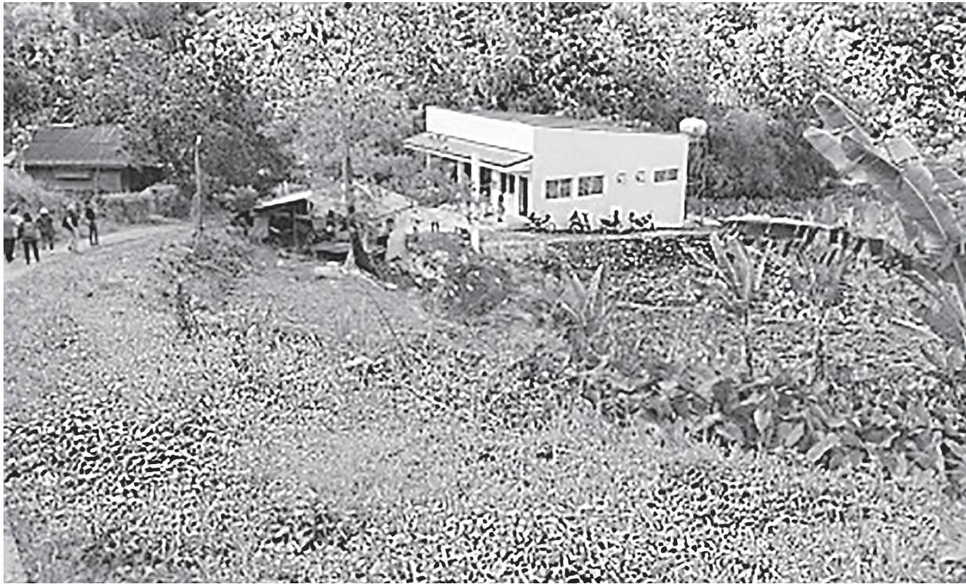
SUPPORT PROJECT. The completed agroforestry value chain facility in Barangay Panuran, Janiuay, Iloilo. Three municipalities in the province received 11 projects under the Forestland Management Project (FMP) for the Jalaur River Basin of the Department of Environment and Natural Resources funded by the Japan International Cooperation Agency.

In his message, Tachikawa expressed hope that the project would not only contribute to climate change mitigation and environment protection but also improve livelihoods and sustained flow of development in the municipalities, creating a positive ripple effect in neighboring communities. (PNA)