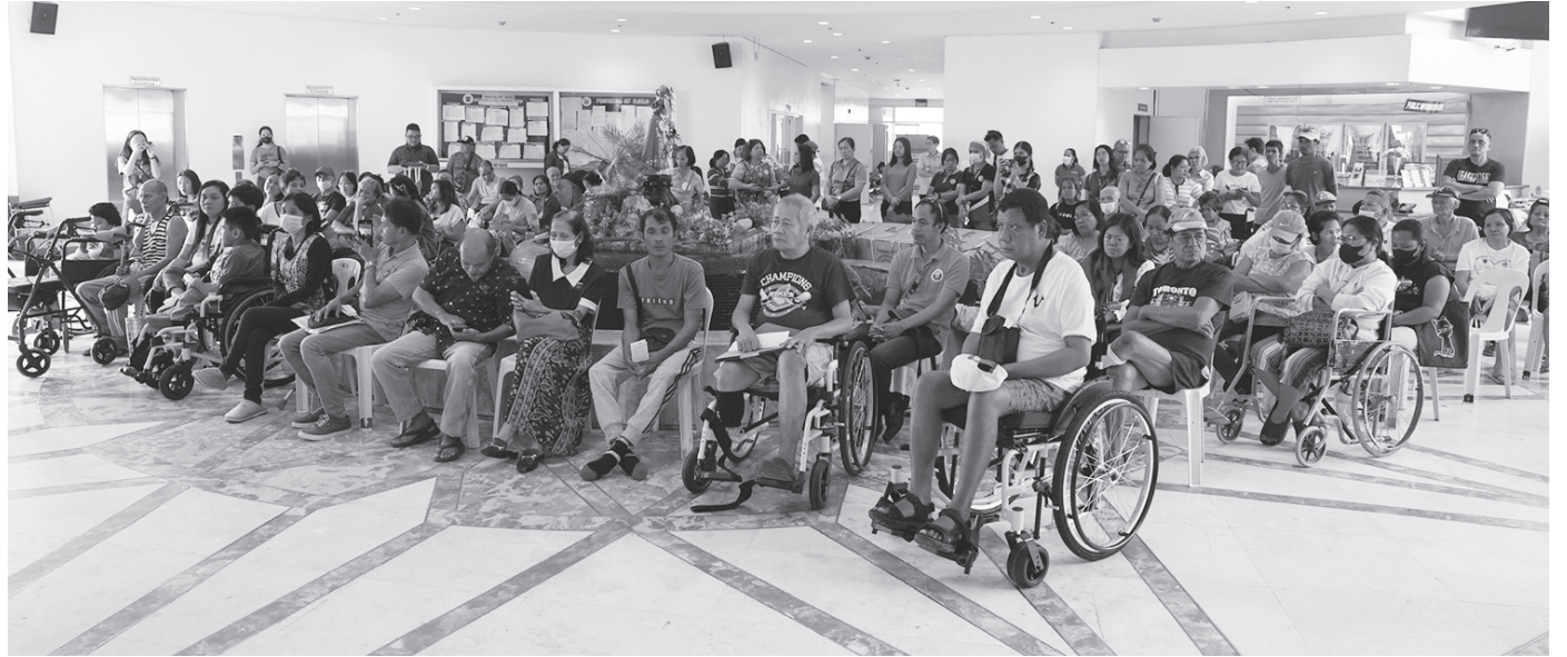
PWD beneficiaries in Iloilo attend the turn-over ceremony of mobility devices that were customized according to their needs.

To recall, it was last year when the provincial government signed a memorandum of agreement with The Church of Jesus Christ of Latter Day Saints for an additional 800 wheelchairs and 834 assistive devices for the province of Iloilo. It is the second biggest provision of the LDS Church next to La Union.