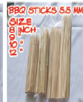
BBQ STICKS 5.5 MM SIZE 10 INCH 12 INCH 14 INCH