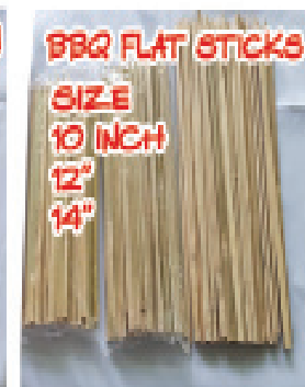
BBQ FLAT STICKS SIZE 10 INCH 12 INCH 14 INCH