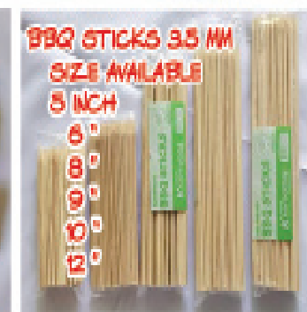
BBQ STICKS 3.5 MM SIZE AVAILABLE 8 INCH 10 INCH 12 INCH 14 INCH