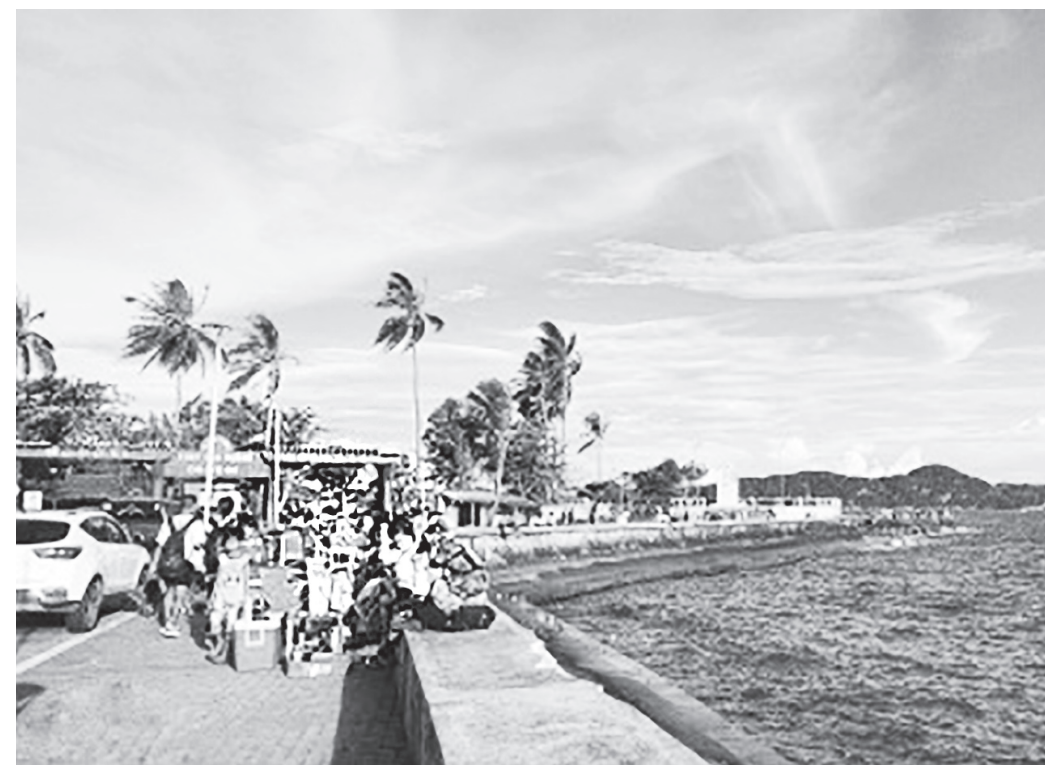
FORT SAN PEDRO. The current state of the Fort San Pedro. The National Museum of the Philippines (NMP) will restore Fort San Pedro or Fort Nuestra Señora del Rosario, an important cultural property built in the 15th century in Iloilo City.

The preparation works will start with an archaeological excavation