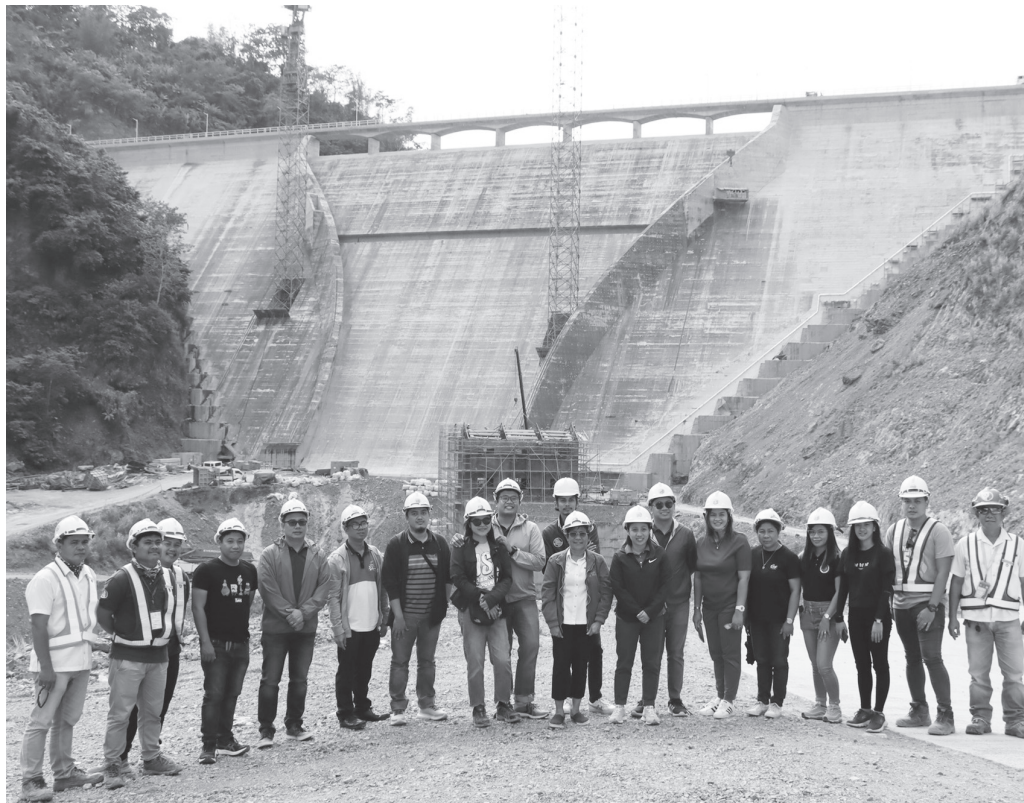
The Regional Project Monitoring Committee (RPMC) of the National Economic and Development Authority (NEDA) conducted site inspection of the Jalaur River Multi-Purpose Project Stage II on February 20, 2024. They visited the ongoing rehabilitation of the existing NIS, construction of the High Line Canal and the ongoing activities in the Jalaur High Dam and Afterbay Dam. (NIA Region 6)

NIA stressed that the JRMP II is projected to expand the production areas of sugarcane and other crops, and usher inclusive rural development through the realization of its eco-cultural tourism, flood mitigation and inland fishery components. (PIA Iloilo)