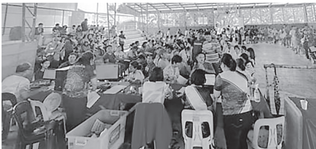
SATELLITE REGISTRATION. The Commission on Elections in Bacolod City holds the first satellite registration for the May 2025 mid-term polls at the covered court of Barangay Pahanocoy on Feb. 17, 2024. Some 554 applicants were accommodated by the Comelec during the voter list-up.