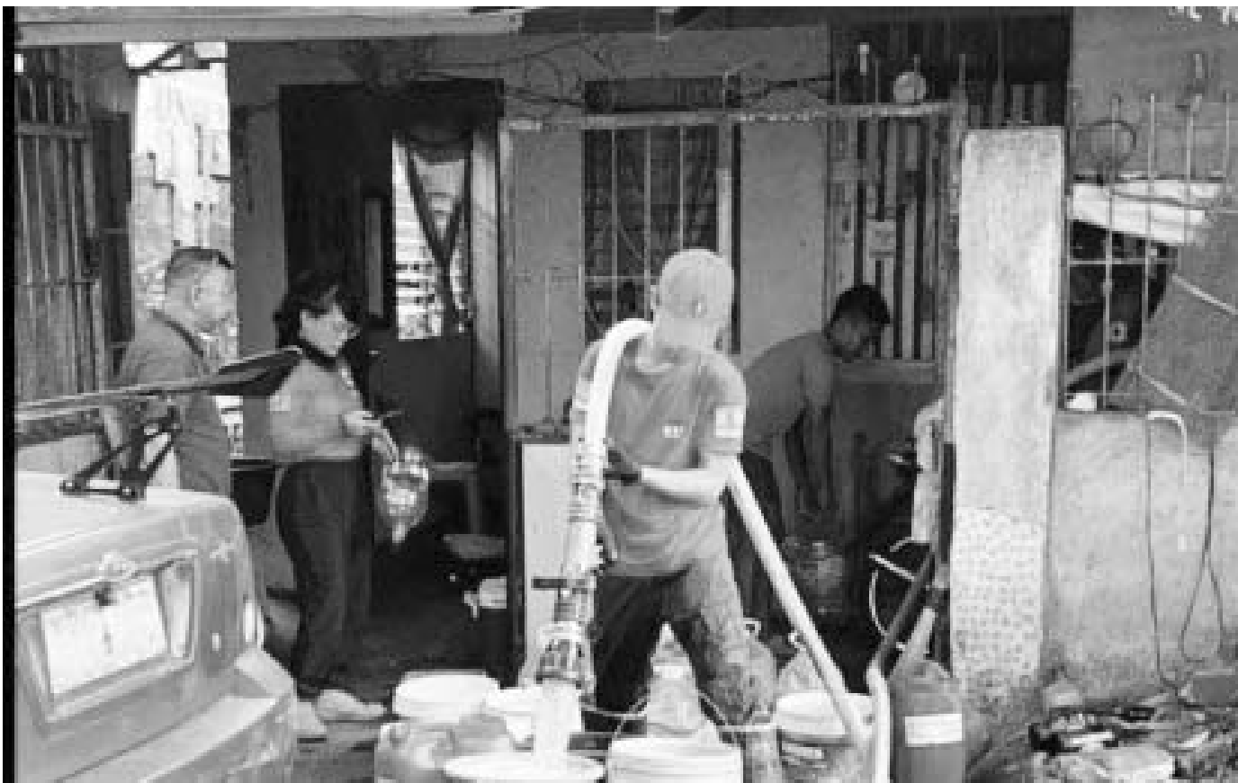
WATER SHORTAGE. Households in an area in Barangay Mansilingan, Bacolod City avail of water supply on Sunday (April 14, 2024). Mayor Alfredo Abelardo Benitez had asked the Bacolod City Water District to submit a water security plan and explain the shortage of supply.

"It has no effect," he said, adding that they met with the alliance and agreed to continue plying their routes. (PNA)