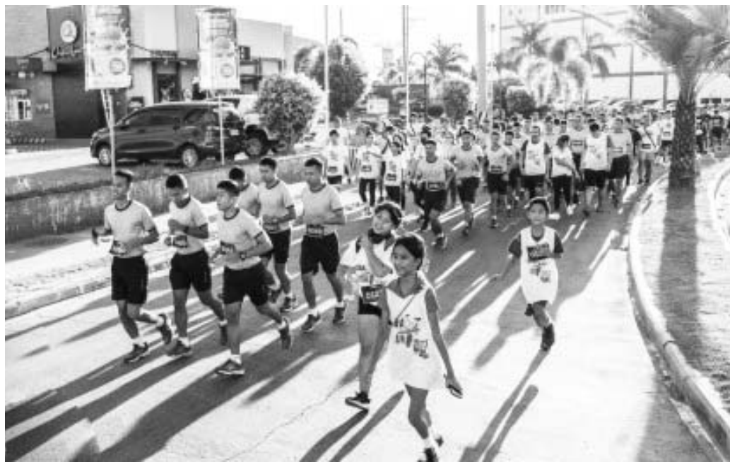
BIDA RUN. Officers of the Iloilo City Police Office join the Buhay Ingatan Druga’y Ayawan (BIDA) run in Iloilo City in 2023. Over 11,000 participants are joining the BIDA RISE and Run advocacy run covering the over five-kilometer stretch of the city road on April 20, 2024.