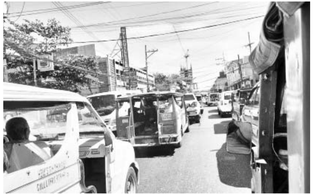
UNAFFECTED. Traffic congestion along Iloilo City's Iznart Street Monday afternoon (April 15, 2024). The Police Regional Office 6 (PRO6) said the traffic caravan failed to cripple transportation in Iloilo and Panay.