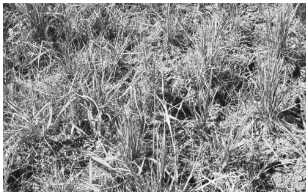
CROP DAMAGE. A dried-up rice farm in southern Negros is shown in this undated photo. As of the second week of April, at least 3,116 hectares of rice fields in 23 local government units in Negros Occidental have been damaged, amounting to PHP168.838 million, a report of the Office of the Provincial Agriculturist (OPA) showed.

Worst-hit are rice farms in the south, particularly