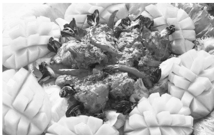
The contestant from Barangay Bontol won first place on two native dishes judged based on their appearance, garnish, texture, aroma, and taste.

Porbida is a native chicken adobo cooked in alupidan leaves that grow abundantly in the area, and papisik is a native chicken stuffed with tomato, onions, and garlic and cooked with salt on a clay pot and firewood with the SNP’s Bantay Gubat volunteers as their cook.