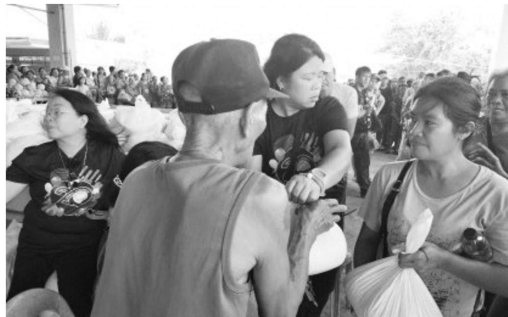
CHEAPER RICE. Buyers queue to avail of well-milled rice sold at PHP20/kilo as a promotional rate during the formal opening of the San Miguel Public Market and Farmers Bagsakan Complex (SMPM-FBC) on Wednesday (May 1, 2024). The complex will consolidate products from 10 Bayanihan Tipon Centers in Panay for distribution to buyers.