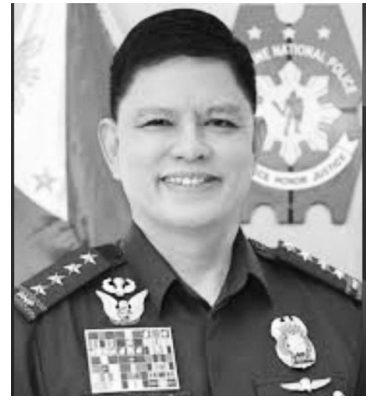
PNP CHIEF MARBIL

The Board of Trustees (BOT) of the newly organized 4th Class Club Metro Manila (4CCMM), an organization of former Philippine Military Academy (PMA) cadets, graduates and non-graduates included, is set for a courtesy call on Police General Rommel Francisco D. Marbil of PMA Class '91.