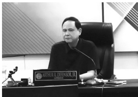
section A (Panay to Guimaras) is up for completion within 2024 and will be completely delivered by the end of the

The Department of Public Works and Highways (DPWH) previously said that the detailed engineering design of