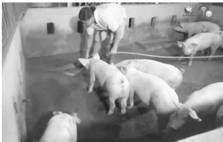
ROAD TO RECOVERY. The hog industry in Iloilo province is bouncing back. Provincial Veterinarian’s Office head, Dr. Darel Tabuada, in a press conference on Wednesday (July 10, 2024), said some commercial and backyard farms in Iloilo resumed with swine raising, while the sufficiency level increased to 71.6 percent after it dropped to around 36.37 percent at the height of the African swine fever (ASF).

Tabuada said that the ASF virus is very resilient and can stay up to 1,000 days in frozen meat, and the only way to protect swine is through biosecurity. (PNA)