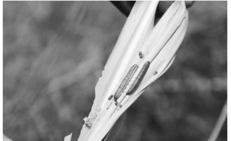
INFESTATION. Fall armyworms infesting a sugarcane plant in Himamaylan City, Negros Occidental, last week. In a report following a field visit and assessment of affected areas from July 3 to 4, 2024, the National Crop Protection Center said it will conduct various studies on the sound management of fall armyworms in sugarcane.

The NCPC report said they will use the collected parasitized eggs and dead larvae covered by fungi to