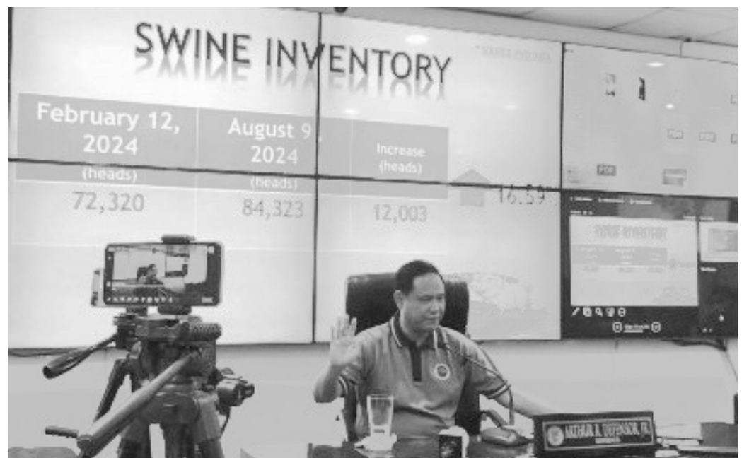
RECOVERING. Swine inventory in Iloilo province increased to 84,323 heads as of Aug. 9 swine inventory, data from the Provincial Veterinarian’s Office showed. Iloilo Governor Arthur Defensor Jr., in a press conference on Wednesday (Aug. 14, 2024), said the backyard industry sustains the supply of pork in the province.

Defensor said the ban on the entry of pork and its by-products coming from selected areas in the country is still in place amid the resurgence of ASF cases in other parts of the country. (PNA)