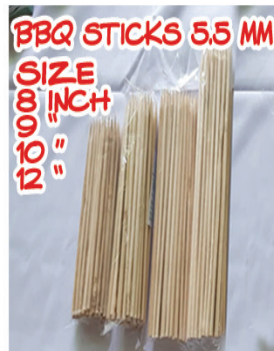
BBQ STICKS 5.5 MM SIZE NO. OF INCH " = "