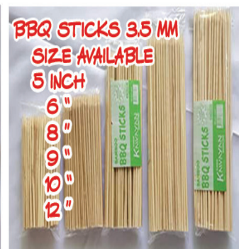
BBQ STICKS 3.5 MM SIZE AVAILABLE 5 INCH 6 INCH 8 INCH 10 INCH 12 INCH