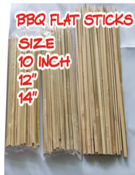
BBQ FLAT STICKS SIZE 10 INCH 12 INCH 14 INCH