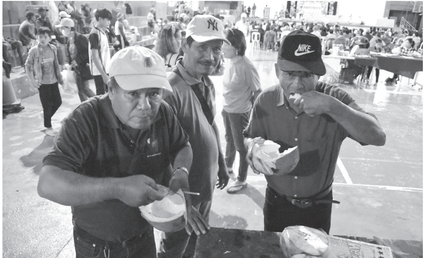
Coconut farmers in Guimaras join the 24th Kalubihan Festival and the 38th National Coconut Week on August 27, 2024 at the Provincial Covered Gym, San Miguel, Jordan, Guimaras.

for the fastest coconut processing (husking, grating, and milking). Farmers also showcased