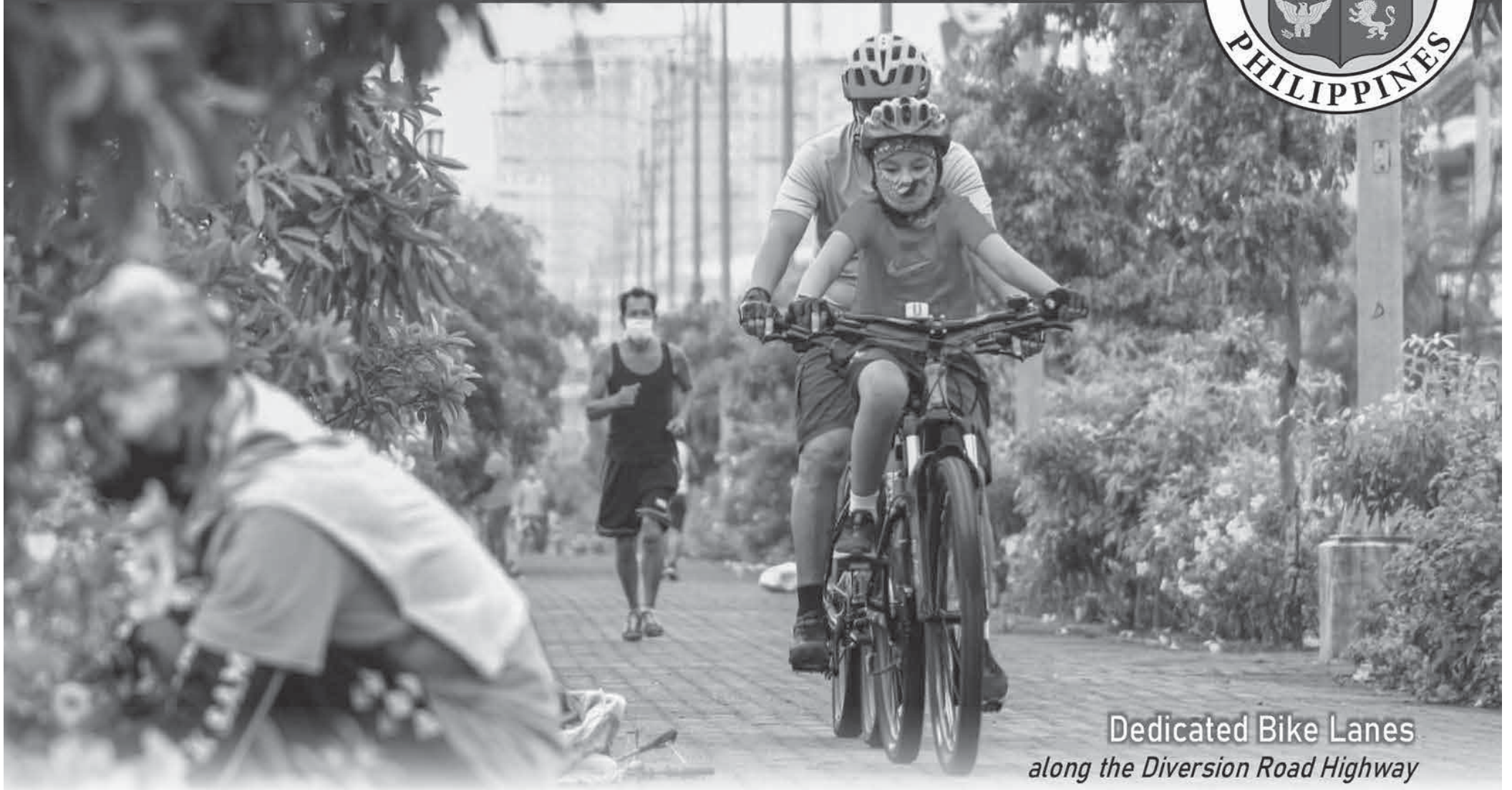
Dedicated Bike Lanes along the Diversion Road Highway

Iloilo City is known as the “most livable city in the country,” owing to its physical transformation with expanding bike lanes that enhanced mobility, open spaces, historical landmarks, heritage structures, tree parks, and urban gardens.