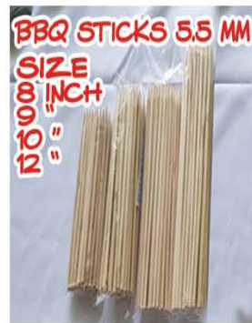
BBQ STICKS 5.5 MM SIZE 8 INCH 10 INCH 12 INCH