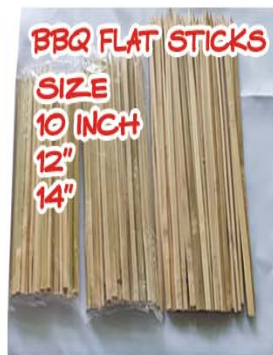
BBQ FLAT STICKS SIZE 10 INCH 12 INCH 14 INCH