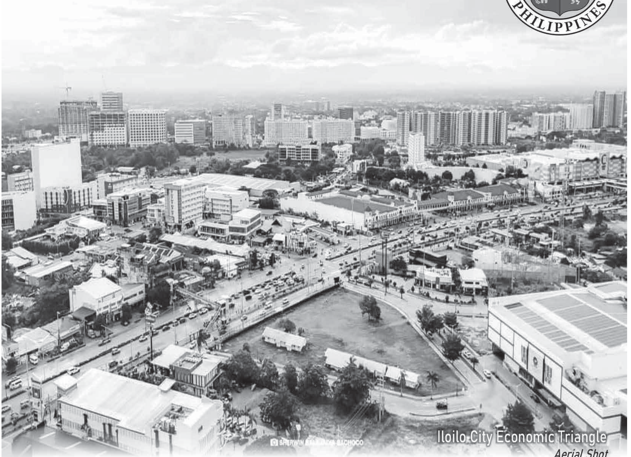
Iloilo City Economic Triangle Aerial Shot

Iloilo benefits from a stable power supply, with the Panay sub-grid maintaining a reliable capacity of 550 megawatts for the next seven years. Future power supply will be augmented with the Integrated Solid Waste Management Facility (ISWMF) in partnership with MetPower / Metro Pacific Iloilo Water (MPIW) investing P2.3 billion. The facility will have the capacity to process 475 tons of solid waste per day, generate up to 3.5 megawatts of power, and supplement the 10-megawatt power required for a Water Desalination Plant. This aims to provide a cost-effective water supply for consumers, further adding to the city's potable water which is currently supplied by Metro Pacific Iloilo Water. In the coming years, the completion of the Jalaur River Multi-Purpose Project and MPIW's desalination plant will ensure that the city has more than enough water to meet its needs.