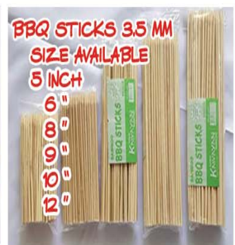
BBQ STICKS 3.5 MM SIZE AVAILABLE 5 INCH 6 INCH 8 INCH 10 INCH 12 INCH