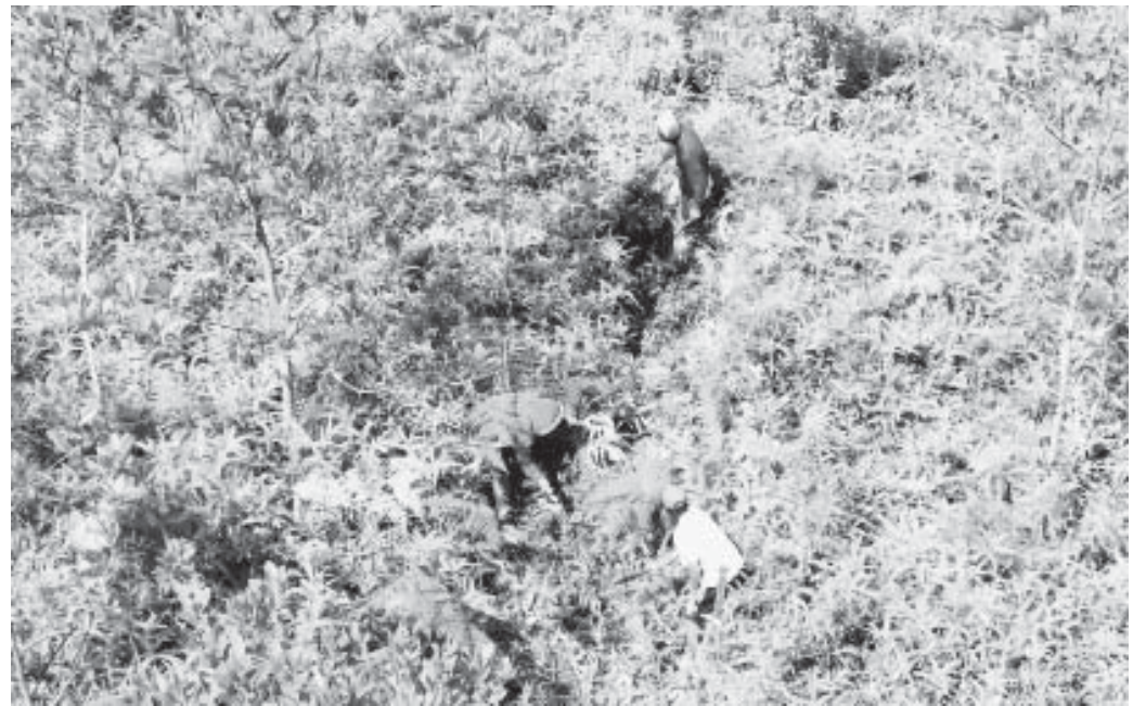
GREENING PROGRAM. The government's National Greening Program generates jobs for over 8,000 individuals in Western Visayas region. In a media forum on Monday (Dec. 16, 2024), the department reported that 121,257.58 hectares have been planted in different NGP plantations in Western Visayas for the 2011-2020 period.

It initially aimed to plant 1.5 billion trees across 1.5 million hectares of public lands between 2011 and 2016. In 2015, the program was expanded through Executive Order No. 193, extending its scope to rehabilitate 7.1 million hectares of unproductive, denuded, and degraded forest lands nationwide from 2016 to 2028. (PNA)