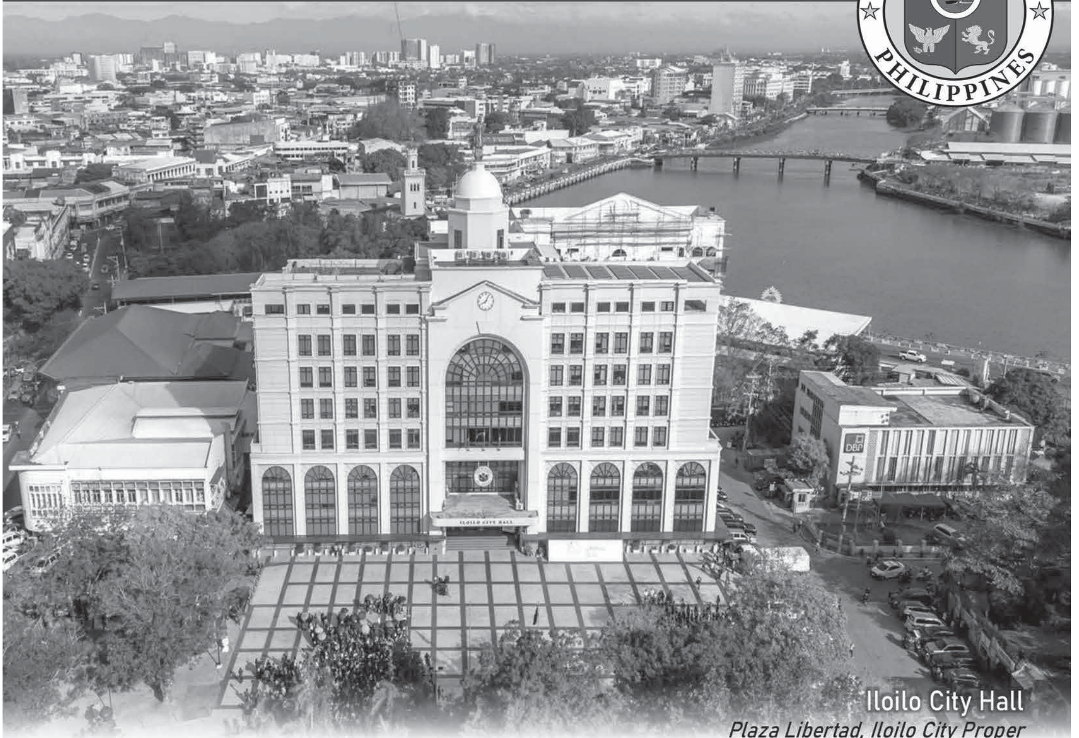
Iloilo City Hall Plaza Libertad, Iloilo City Proper

Iloilo City's programs, projects, and initiatives have been recognized as best practices which receive multiple awards and recognitions. This is evident with the Philippine Chamber of Commerce and Industry's award of the Most Business-Friendly Local Government Unit in 2023. In the Department of Trade and Industry's Cities and Municipalities Competitiveness Index Survey, the city is ranked the "5th Most Competitive Highly-Urbanized City" throughout the Philippines and the 1st outside the NCR. Iloilo City has been designated as UNESCO's Creative City of Gastronomy in 2023, making it the Philippines' first and only city of gastronomy.