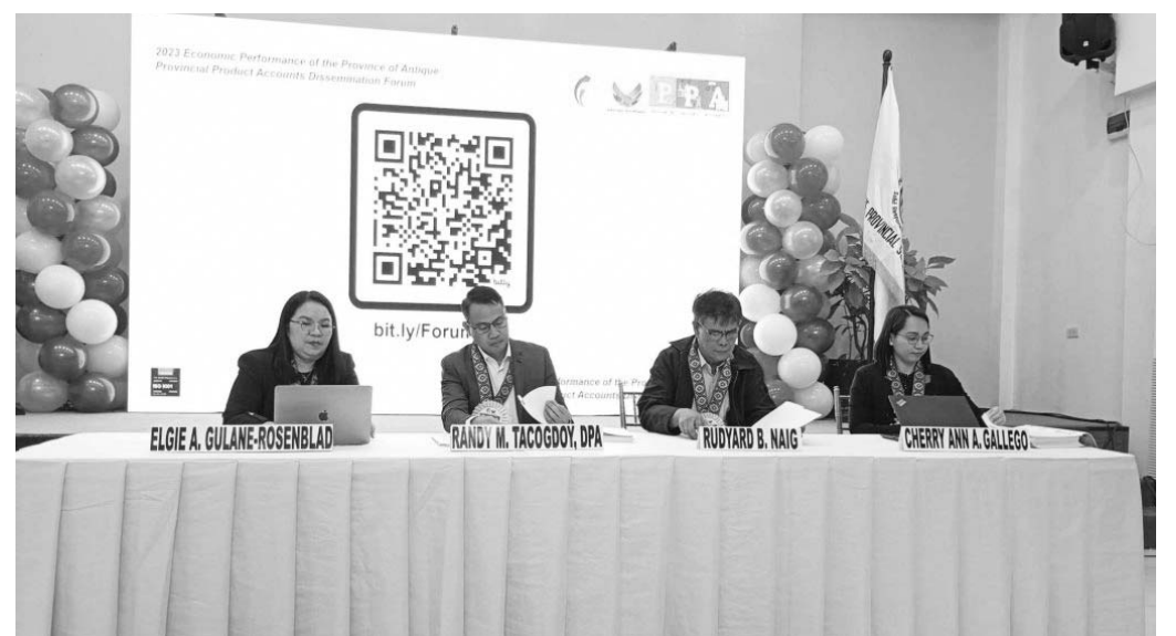
Philippine Statistics Authority conducts a data dissemination forum in Antique to highlight the growth of GDP and other economic indicators attended by various sectors including the local media practitioners.

However, the economy of the province recorded a