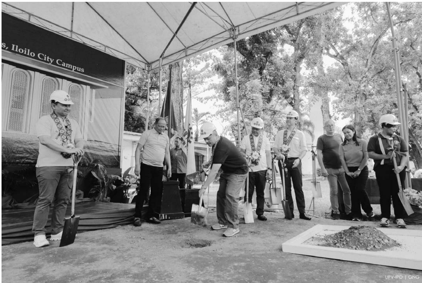
Department of Education Sec. Juan Edgardo “Sonny” Angara (left), former senator and UP law alumnus, graced the groundbreaking of the UP College of Law building at the UPV Iloilo City campus on December 12, 2024.