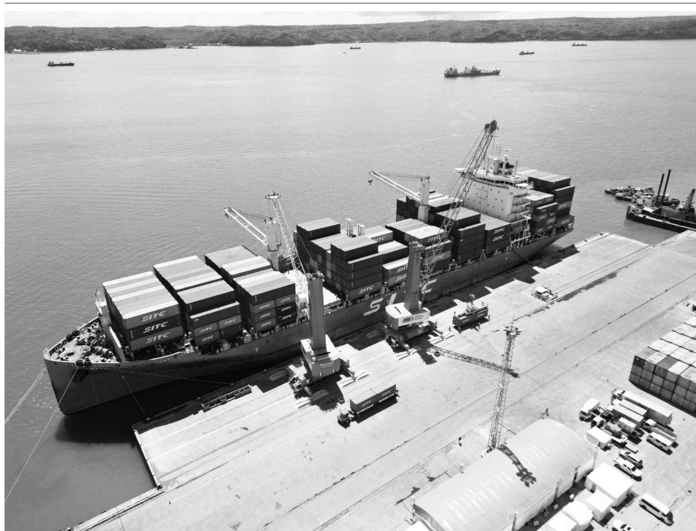
Visayas Container Terminal, last September 2024 inaugurated two new mobile harbor cranes, enabling the terminal to handle the increasing volume of containerized, bulk, general and project cargo in Panay and Region 6.

For inquiries or assistance, the public is encouraged to contact the ICPO Hotline Numbers: 0908-377-0194 or 335-0299, or visit the nearest police station. (PIA6-Iloilo/ICPO)