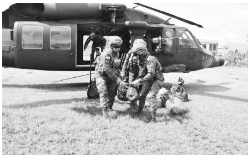
SLAIN REBEL. The body of a communist rebel killed in an encounter with government troops in Tapaz, Capiz on Dec. 28, 2024 is carried by government soldiers. The Philippine Army’s 12th Infantry Battalion also seized from the encounter site one rifle and five backpacks, a 3rd Division Public Affairs Office (3DPAO) report said on Monday (Dec. 30, 2024).

Sison likewise urged the local populace to remain vigilant and cooperate with the authorities by reporting the enemy’s suspicious activities threatening their safety, especially during this holiday season. (PNA)