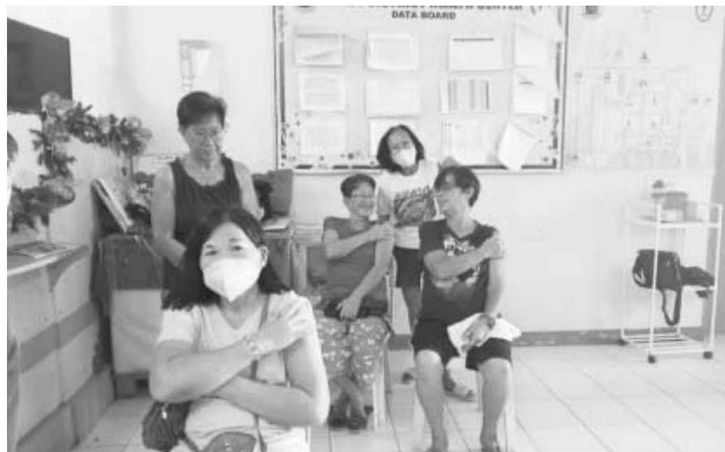
FREE FLU VACCINES. Free influenza vaccines are available at Iloilo City's Jaro district health center. The city government, as of Thursday (Dec. 26, 2024), has vaccinated more than 63,000 Ilonggos through various district health centers and at the flu vaccination site at the city hall.

frontline workers, chronic kidney disease, It is also open for chronic lung disease, heart individuals with diabetes, failure, and cancer. (PNA)