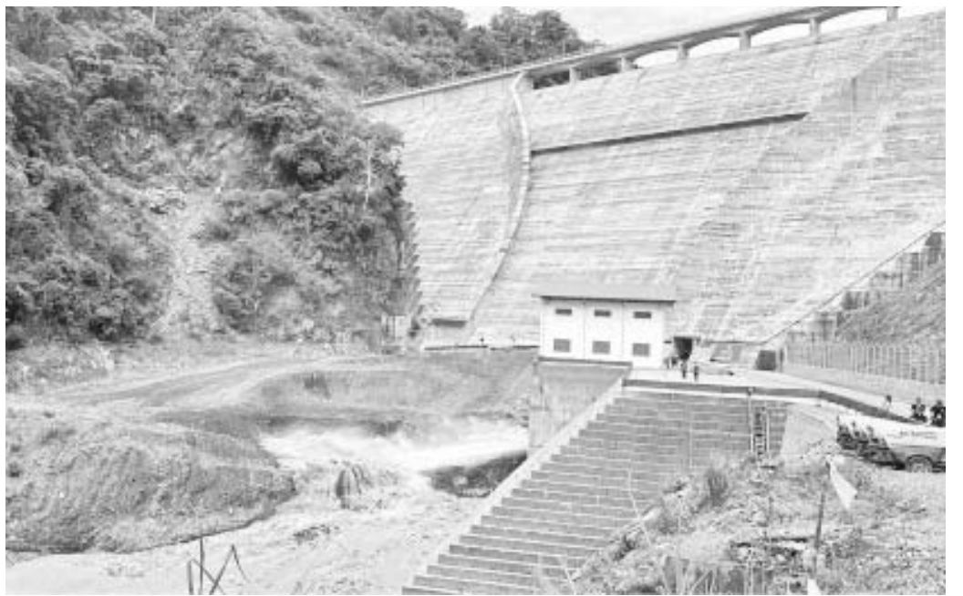
JALOUR DAM. The Jalaur River Multi-Purpose Project Stage II in Calinog, Iloilo, tagged as the largest water reservoir project of the National Irrigation Administration outside Luzon. It is expected to expand NIA's irrigation service by 9,500 hectares, benefitting 7,000 farmers across 17 towns in Iloilo.