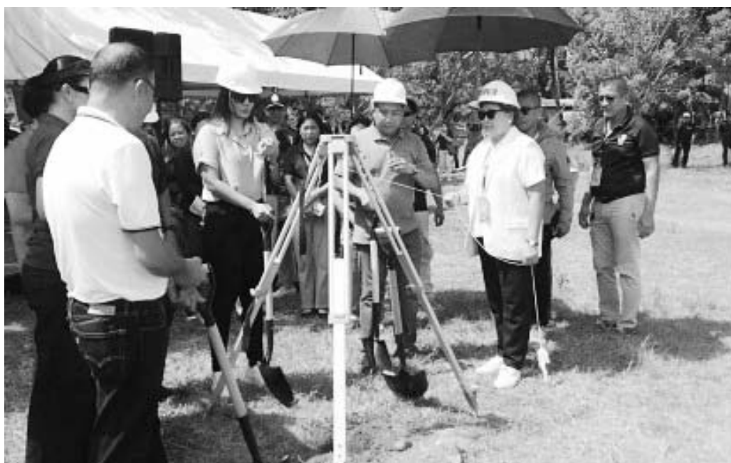
GROUNDBREAKING. Antique Governor Rhodora Cadio (right) drops the time capsule during the groundbreaking ceremony of the Binarayan Village 4PH Towers in Barangay San Pedro, San Jose de Buenavista on Wednesday (Feb. 12, 2025). Cadio said in her message that the housing units will be built to the highest standard.

The socialized housing units are set for turnover to qualified applicants in 2028. (PNA)