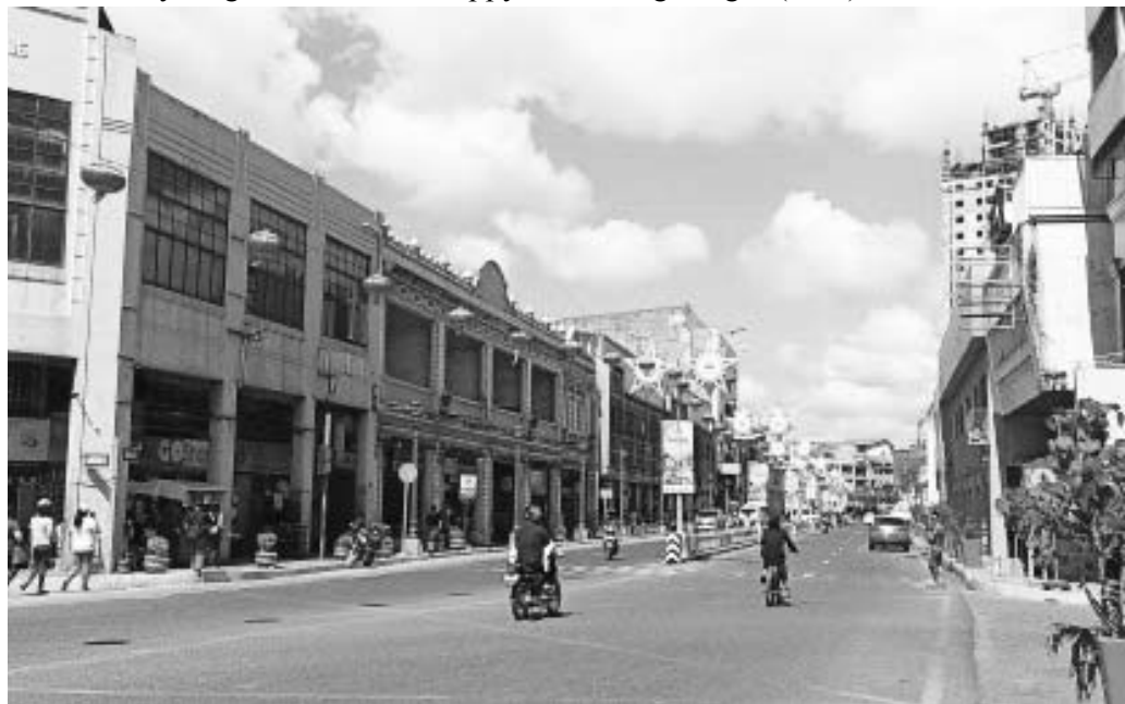
TAX INCENTIVES. Heritage buildings line up the Calle Real Street in this photo taken on Jan. 24, 2025. The city government is eyeing additional tax incentives for owners of buildings to repair and repaint the old structures.

The NCCA, according to the mayor, is ready with a PHP6.5-million budget for the repair of the structure. (PNA)