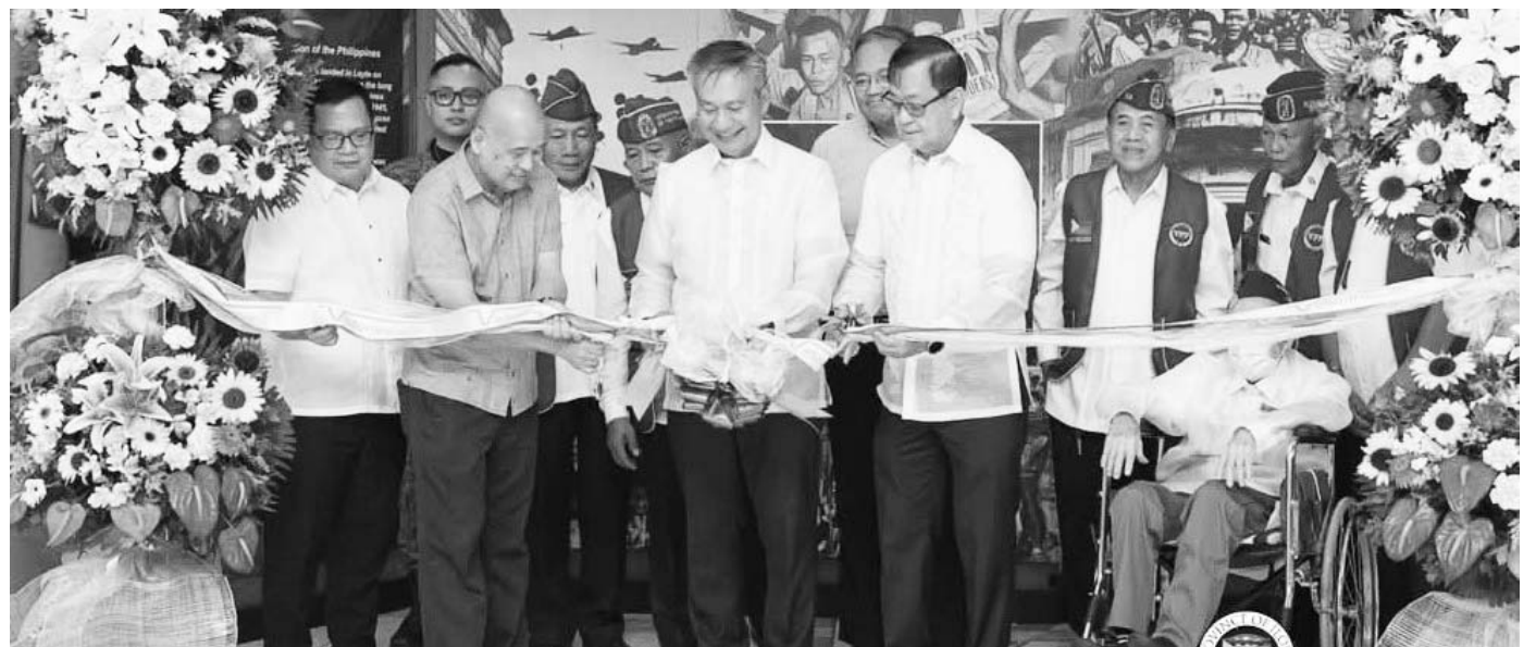
The Philippine Veterans Bank (PVB) opened its World War II Exhibit—"War of Our Fathers" to the public at the Iloilo Provincial Capitol Lobby from March 18 to 30 in line with the commemoration of the 80th Victory Day in Panay, Romblon and Guimaras.

Meanwhile, the exhibit's opening ceremony included a tribute to surviving war veterans and their families along with the discussion of local resistance's significant role during the World War II.