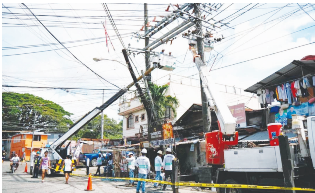
Linemen and engineers of NGCP and MORE Power during the swinging of Baldoza feeder using bypass line to facilitate load transfer to the newly commissioned 100MVA transformer at NGCP's Iloilo City substation.