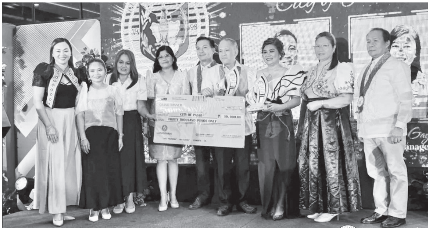
Passi City was hailed as champion during the 2024 Governor's Award for Best PESO, an annual recognition for outstanding Public Employment Service Offices (PESOs) across Iloilo Province.