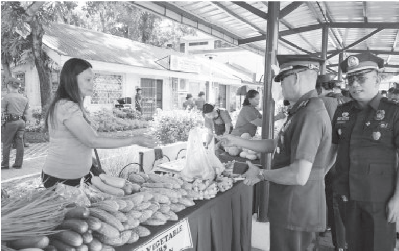
KADIWA NG PANGULO. Police officers from the regional office in Western Visayas purchase affordable goods offered at Kadiwa ng Pangulo at Camp Martin Delgado in Iloilo City on Monday (April 14, 2025). The initiative was a partnership between the Department of Agriculture and Police Regional Office.

He said discussions are ongoing regarding the frequency of the KNP store operations and the possibility of expanding the initiative to provincial police headquarters after the Holy Week. (PNA)