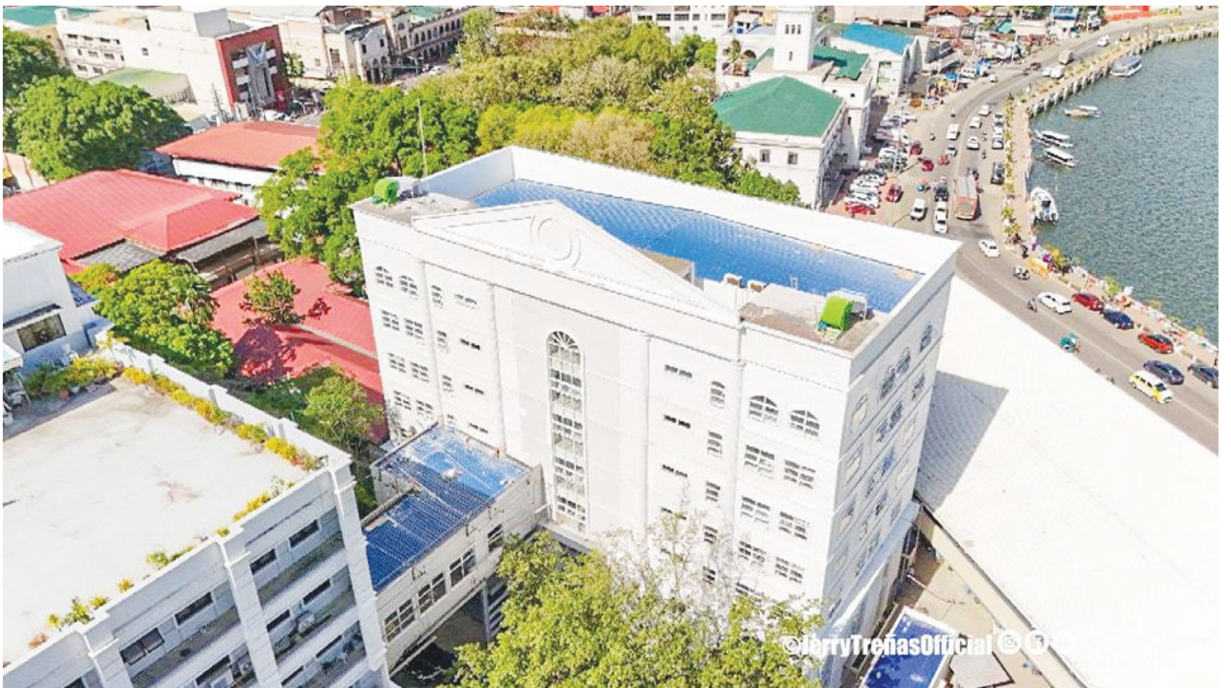
THE LEGISLATIVE BUILDING. The Iloilo City Legislative Building is just one of landmark infrastructure projects realized under the leadership of Mayor Jerry Treñas. A symbol of progress and effective governance, this modern facility, valued at P246.89 million and financed through the city's general fund, was envisioned to streamline legislative processes and provide a more conducive environment for public service.

These initiatives span various categories, including vertical structures, electrical systems, roads, drainage, public markets, plazas, the Iloilo City Action and