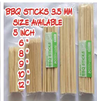
BBQ STICKS 3.5 MM SIZE AVAILABLE 5 INCH 6" 8" 12"