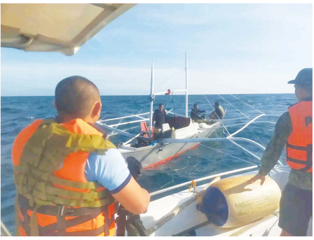
Iloilo Provincial Bantay Dagat Task Force (IPBDTF) personnel nabbed ten fishermen on board two vessels engaging in dynamite fishing in the areas of Sitio Baliguian, Mangalabang in the municipality of Concepcion on April 1.

They were charged for violating Section 92 of Republic Act 8550 or The