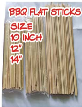
BBQ FLAT STICKS SIZE 10 INCH 12" 14"