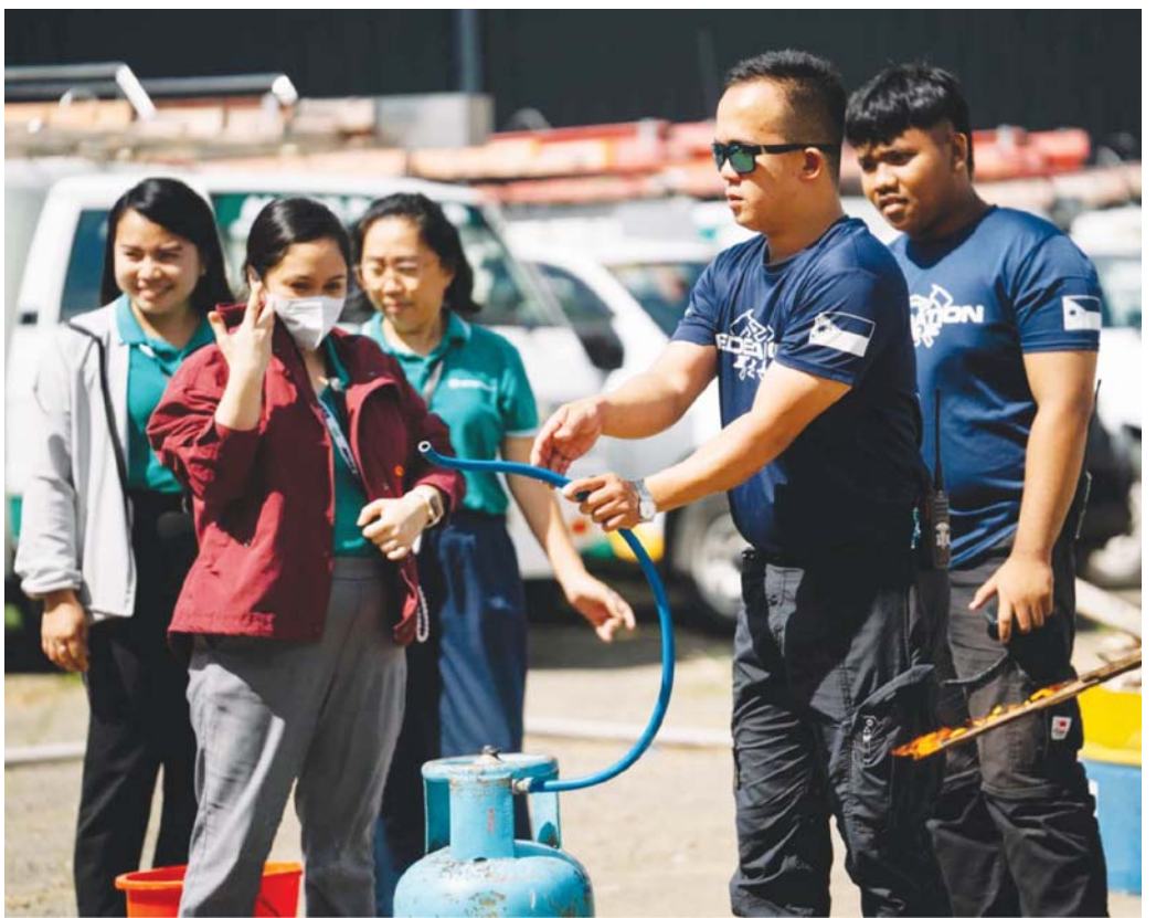
MORE Power personnel took part in the annual fire drill conducted by the Bureau of Fire Protection (BFP) to raise awareness on proper fire prevention and response.

Despite their busy day-to-day activities accommodating customers in their office, MORE Power took part and even involved their customers in