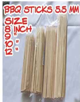
BBQ STICKS 5.5 MM SIZE 10" 12" 14"