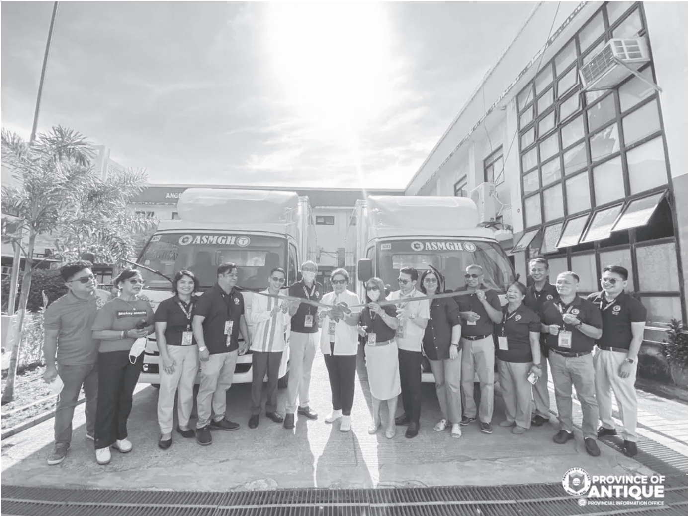
Antique Governor Rhodora Cadio led the inauguration and turnover of thermal decomposition machine to Angel Salazar Memorial General Hospital (ASMGH) in the town of San Jose de Buenavista on April 7.

Meanwhile, Governor Rhodora Cadio stressed that the said initiative is the best solution to addressing Antique’s ongoing concerns regarding hospital waste management. She also cited that the said machine is only the first and eyes to procure another one for each district hospital in Antique.