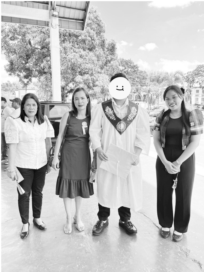
One of the residents of Balay Pagbag-o earned his senior high school diploma in a recent graduation rites.

Further, Balay Pagbag-o residents were honed to become socially responsible individuals and productive citizens for their reintegration to the communities. (AAL/ LMLE/PIA Iloilo/With reports from PSWDO)