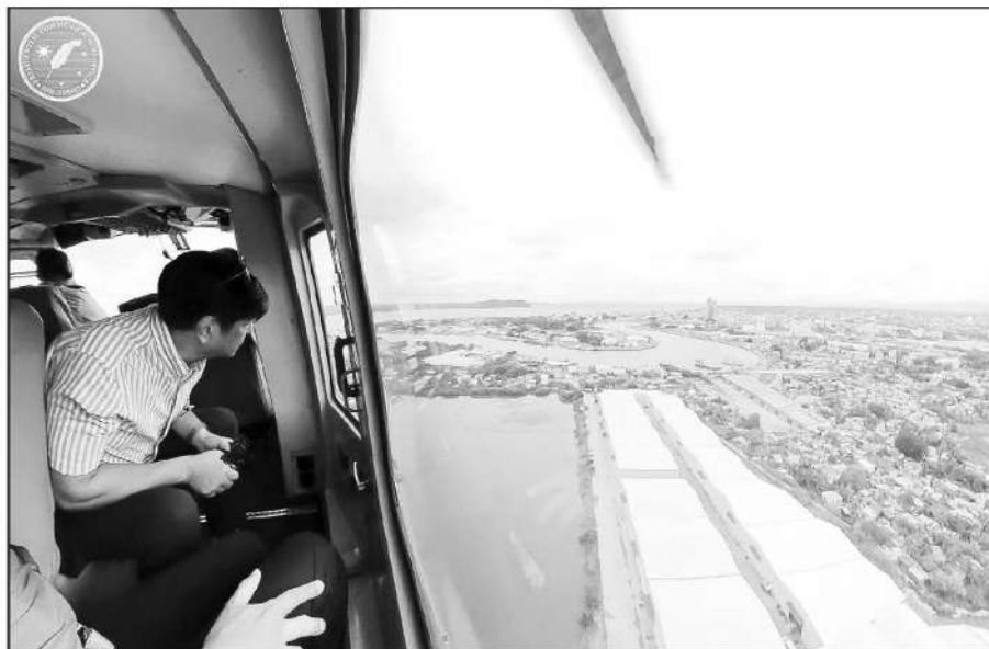
President Ferdinand R. Marcos Jr. inspected the Flood Mitigation Project in Iloilo City, specifically Sections 9 and 10 located in Barangay San Isidro, Jaro during his visit on August 13, 2025. He observed that the project has long been delayed and worsened the flooding in certain areas. He ordered the Department of Public Works and Highways (DPWH) to hold accountable and blacklist the negligent contractors.