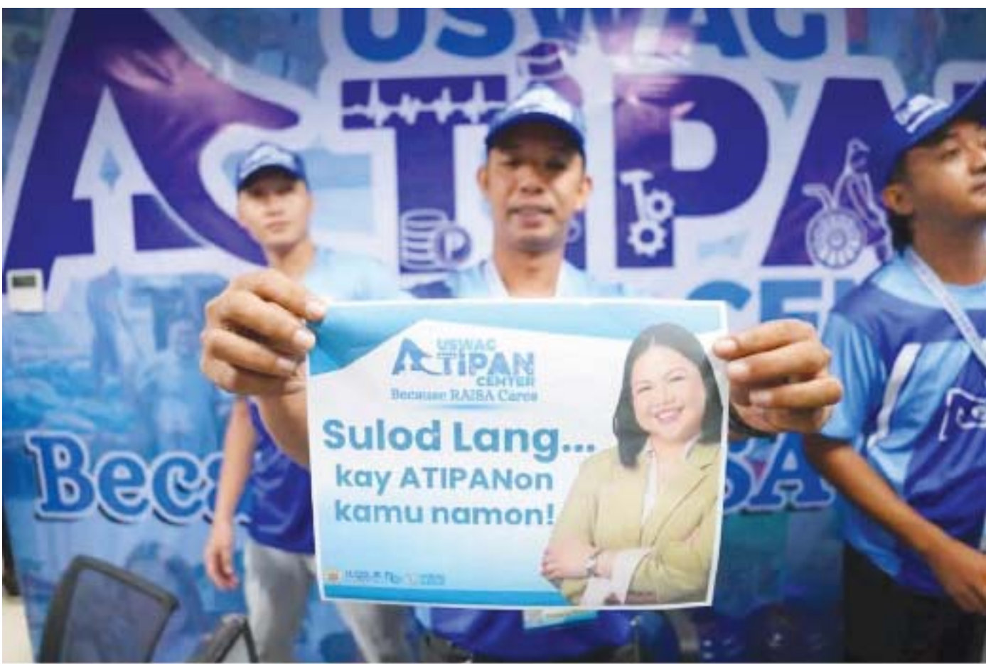
A personnel holds a welcome poster during the opening of the Iloilo City Government's USWAG Atipan Center at Iloilo City Hall.