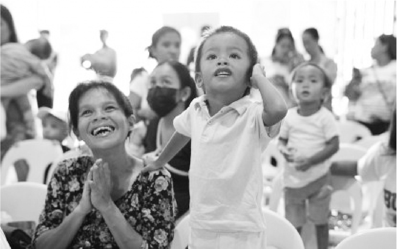
‘PUROKALUSUGAN.’ Residents of three pilot barangays avail of various services during the launch of “PuroKalusugan” in Barangay So-oc in Arevalo district, Iloilo City on Wednesday (Aug. 20, 2025). The community-based health initiative emphasizes preventive care, disease prevention, and health interventions.