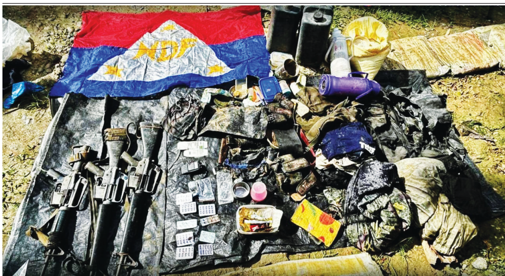
Three high-powered firearms and personal belongings of fleeing remnants of the Communist Terrorist Group (CTG) were seized by 82nd Infantry (Bantay-Laya) Battalion troops on September 28, 2025, in Capiz.